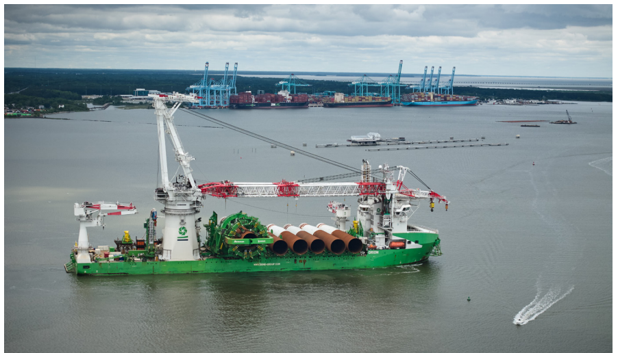
DEMA Group's Orion vessel departs Portsmouth Marine Terminal with the first six monopile foundations for Dominion Energy's Coastal Virginia Offshore Wind (CVOW) project.

In May, the first monopile foundations for Dominion Energy's Coastal Virginia Offshore Wind (CVOW) project departed our harbor aboard DEMA Group's Orion vessel. The CVOW project is the largest offshore wind project in the nation to date and, once completed, will power the equivalent of 660,000 homes with clean, reliable energy. The Port of Virginia has invested $220 million to transform Portsmouth Marine Terminal into America's most capable offshore wind hub to support this growing industry.